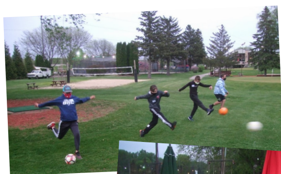
MSYC Playing Footgolf & Enjoying Ice Cream Together

Grab some gloves and solid shoes and join us on Saturday, June 26 from 11:45-2:00 at the Forward Gardens located at 7492 West Old Sauk Road in the Town of Middleton, west of the beltline and part of the Pope Farm Conservancy. We worked at this community garden last fall and the group had a great time! Space is limited, so you must sign up by June 25.